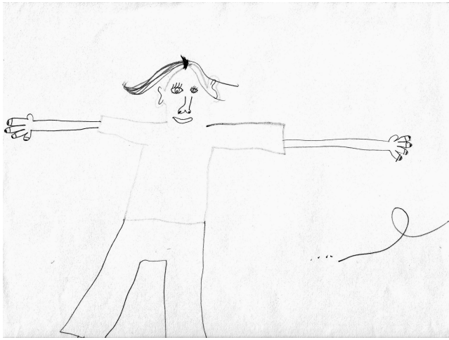
FIGURE 1.—Rachel's "Draw-a-Person" drawing.

liked school and sports, and was playing with friends (see Figure 1). As the parents watched from behind the mirror, Sherry voiced that the position of the girl's arms suggested the girl was "ready for a hug." Aaron observed that Rachel took up so much space on the paper that she had limited room to complete the drawing, which reminded him of how Rachel often ran out of space on her homework papers. Rachel also ran out of space on the chalkboard when she played hangman during free play. It seemed to us that Rachel commonly running out of space when she drew or did work illustrated how difficult it was to contain her and her expansive personality.